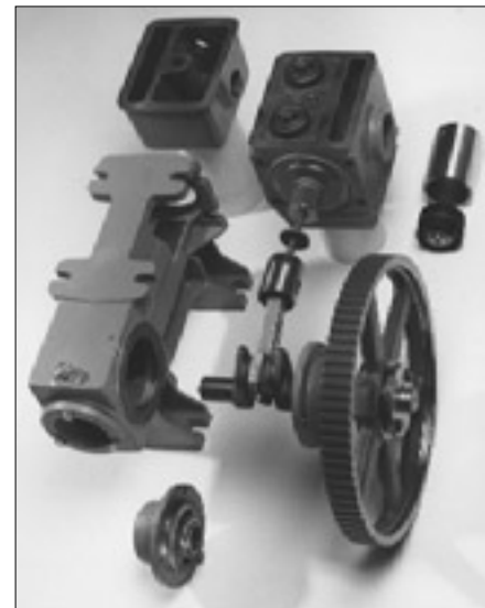
Disassembled pump showing the major parts

"We have one [Solar Force] pump that serves a community of 30 people and visitors. It more than adequately meets our needs."